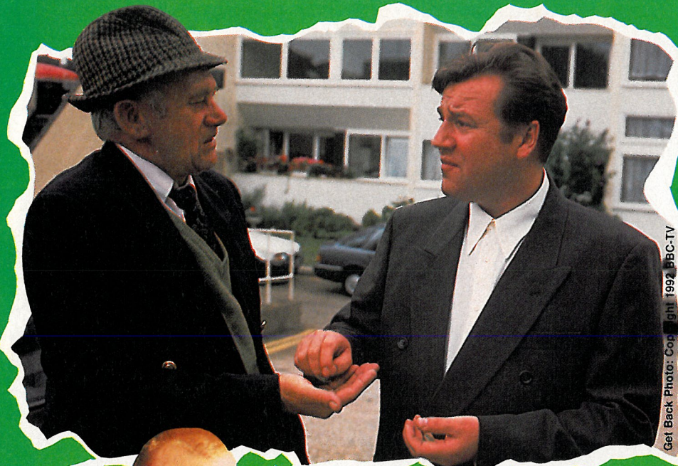
Get Back