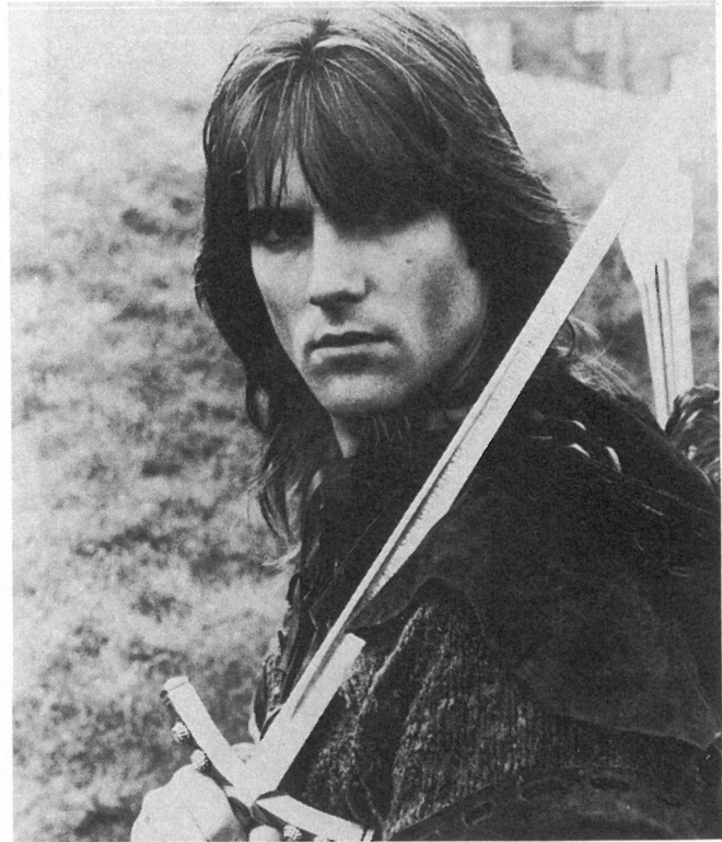
Michael Praed as Robin Hood.